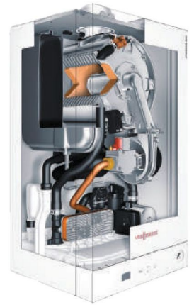
050-W showing components