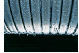
Inox-Radial heat exchanger

For all other accessories please see page 25