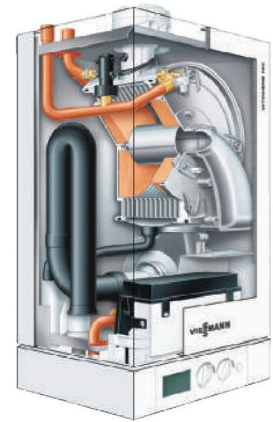
100-W Open Vent showing components