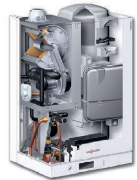
111-W showing components