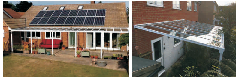
The Simplicity 6