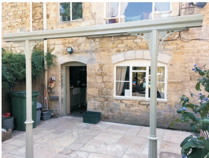
The Simplicity 6 with the Victorian Upgrade