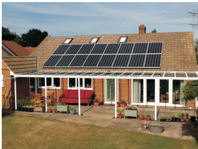
The Simplicity 6

All of our structures have a sleek modern, appearance however, once paired with our Victorian Upgrade, they are instantly transformed into traditional, decorative structures.