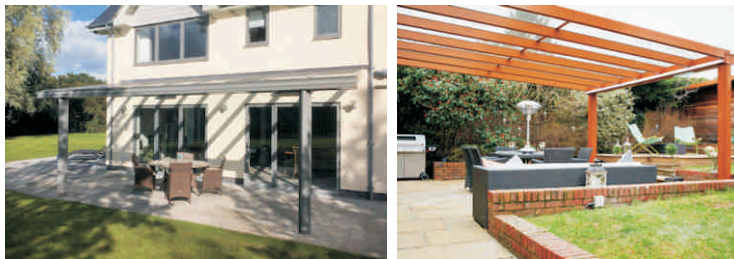
The Simplicity Alfresco

Both structures feature fully aluminium frameworks and hidden, integral guttering. They have been engineered to conform to UK wind and snow loadings.