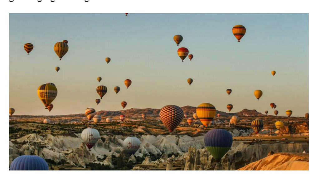
ENJOY A SCENIC FLIGHT ACROSS...

The curious geology of Toblerone-shaped pinnacles and Neapolitan-coloured rock formations rising from the stark plains of Anatolia is the stuff of fairytales. Inspired by the natural erosion of the landscape, thousands of years ago humans began to carve out a spectacular chamber and tunnel complex from the soft rock, forming entire troglodyte villages in <u>Cappadocia</u> with rock-hewn churches, cavernous living quarters and storehouses. The iconic pointy fairy chimneys hint at the extraordinary, chiselled homes beneath, used as a place of religious refuge by Christians fleeing persecution from Rome in the 4th century. Days could be spent exploring the underground dwellings but for an unforgettable view of the Göreme Valley and its chimneys opt for a leisurely hot air balloon ride at sunrise, gently drifting over orchards and vineyards as the growing light changes the colours of the volcanic terrain.